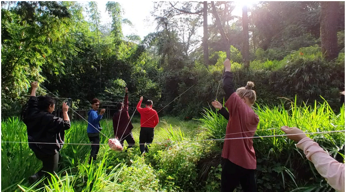
Heart ritual on volcano Merapi, during the analogue meeting of TPA in Padang Panjang 2024.

A performative environment on new ecologies, long-term collaborations between Europe and Southeast Asia, transcultural glitches, artistic solidarity, and (digital) performativity.